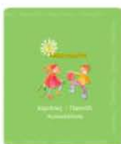
© Ε.ΔΙΑ.Μ.ΜΕ - ΠΑΝΕΠΙ... Μαργαρίτα 1