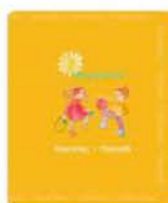
© Ε.ΔΙΑ.Μ.ΜΕ - ΠΑΝΕΠΙ... Μαργαρίτα 2