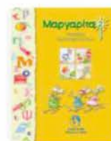
© Ε.ΔΙΑ.Μ.ΜΕ - ΠΑΝΕΠΙ... Μαργαρίτα 2