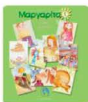
Μαργαρίτα 1