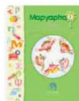
© Ε.ΔΙΑ.Μ.ΜΕ - ΠΑΝΕΠΙ... Μαργαρίτα 1