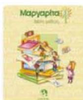
Μαργαρίτα 3